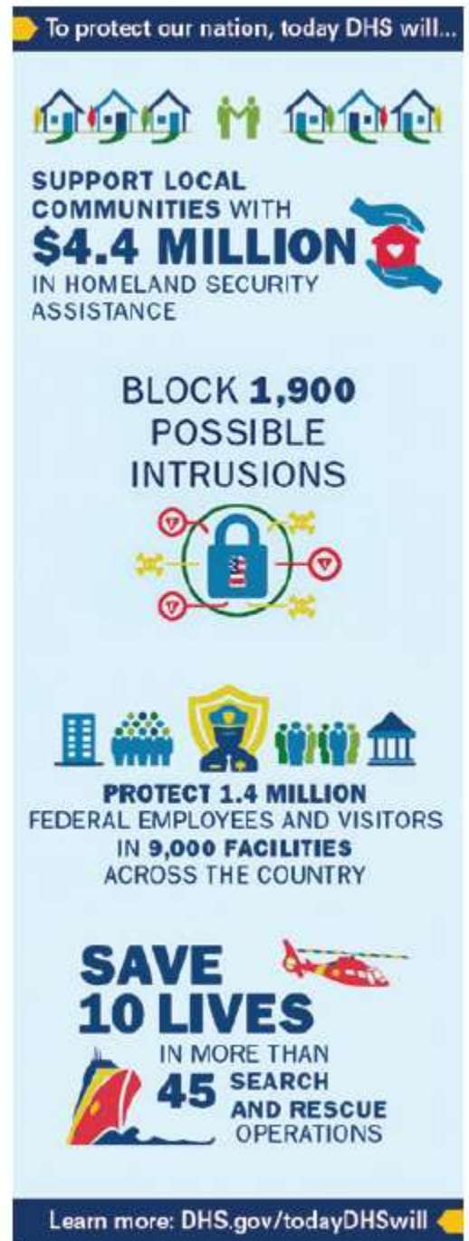
Figure 2. A Day in the Life of DHS

Original article posted in the Journal of Government Financial Management Winter 2016-16 Vol. 65, NO. 4. To read the original article, visit AGA's website .